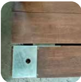
Steel to Steel connectors