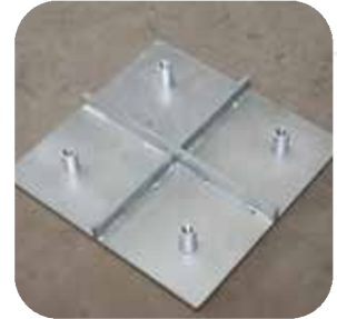
4 way connector