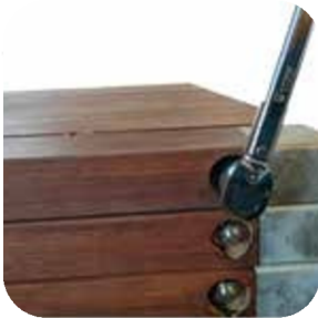
Modular spine rod