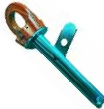
Dedicated lifting device