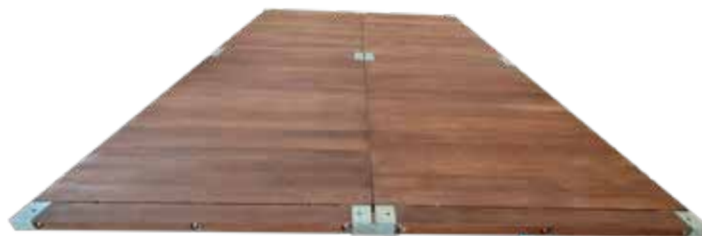
4 connected ECM-70 units – 21 square meters