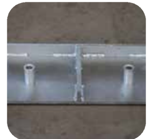
2 way matting edge steel connector