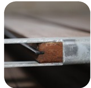
Integral beam locking rib