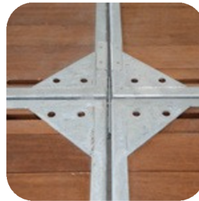
4 way central connector 4 screws per mat