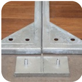
2 way matting edge steel connector