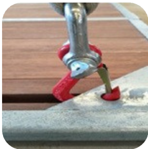
Dedicated lifting point