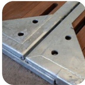
4 connector screws per mat