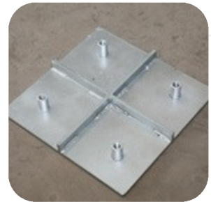
4 way connector