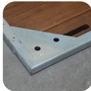
Reinforced corner gusset with side pocket repair access